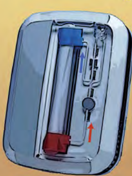
Ambulatory kidney (backpack size)